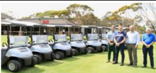
10 Electric Buggies available kindly sponsored by Jackson's 4x4 Murray Bridge

Visit our website for dinner times and current menu's. Non-members are always welcome. Our 12 machine gaming room is Covid aware, quiet, and latest machines Bank note and coin. Our Golf course is regarded as one of the best winter course state-wide, Pro Shop Available