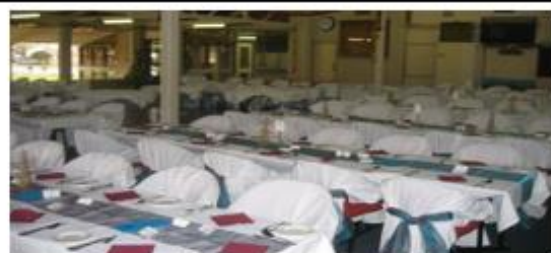
Birthdays, weddings, wakes, parties all catered for at our upgraded function room