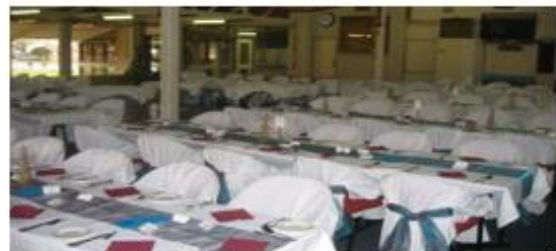
Birthdays, weddings, wakes, parties all catered for at our upgraded function room