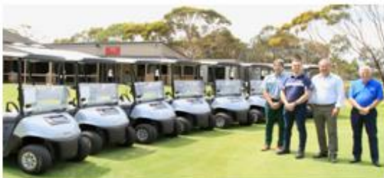
10 Electric Buggies available kindly sponsored by Jackson's 4x4 Murray Bridge

Visit our website for dinner times and current menu's. Non-members are always welcome. Our 12 machine gaming room is Covid aware, quiet, and latest machines Bank note and coin. Our Golf course is regarded as one of the best winter course state-wide, Pro Shop Available