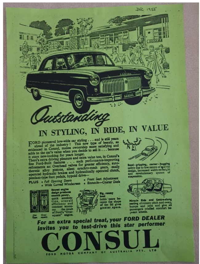
From "Modern Motor 1955" Left April. Right Dec.